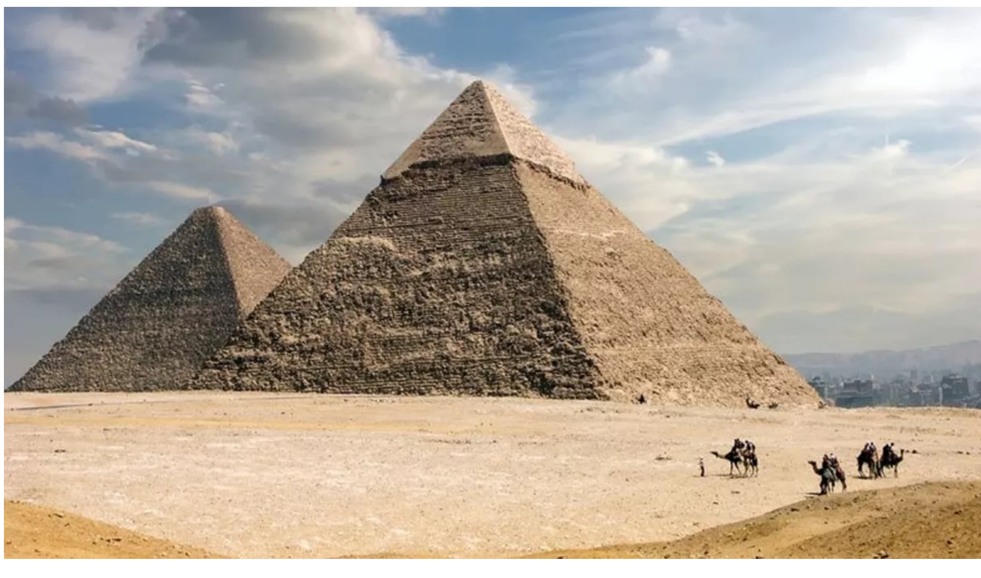
The Great Pyramids of Giza in Egypt

Humans have left clues of our existence throughout time, leaving behind burials, artifacts and written records that hint at our evolution, beliefs, practices and cultures. Studying the archaeological record shows us that the oldest known bones belonging to Homo sapiens are 300,000 years old, or that the world's oldest civilizations arose at least 6,000 years ago.